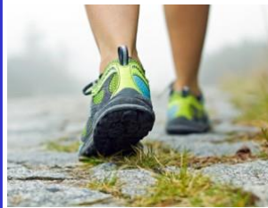
Go for a walk