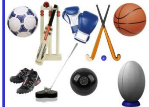
Play a sport