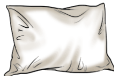
Punch a pillow