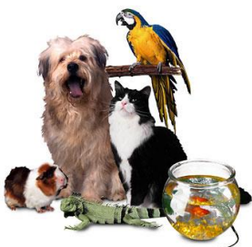
Spend time with a pet