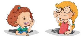
Talk to a friend