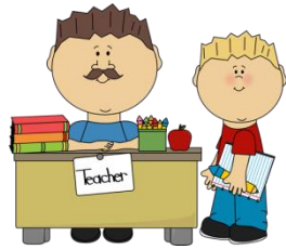
Talk to the teacher