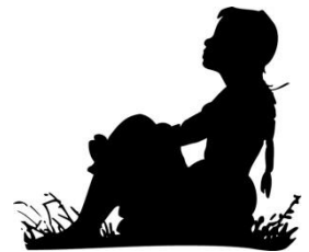
Time out / Quiet time