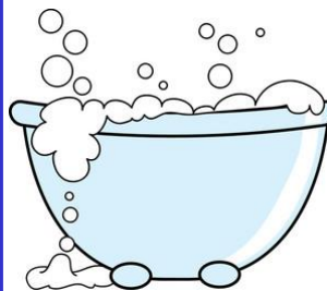
Have a bath