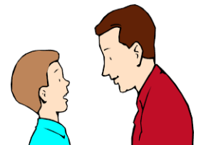
Tell Mum or Dad