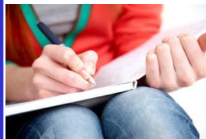
Write it down